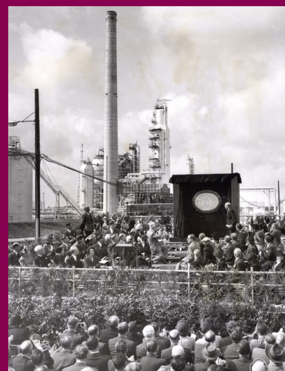
Prime Minister Clement Attlee opens Fawley Refinery in September 1951.

Community Matters is distributed every other month to about 23,000 households. You can also view the newsletter on the Fawley Online website. Go to fawleyonline.org.uk .