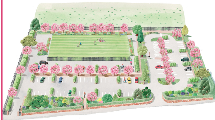
An artist's impression of the new picnic lawn