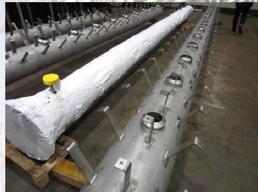
Burner Runner final inspections and preparation for shipping