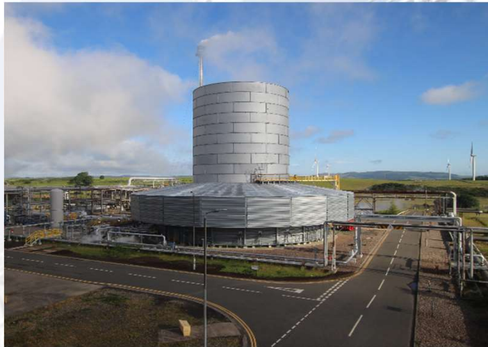
EGF successfully started-up 27 th June 2023