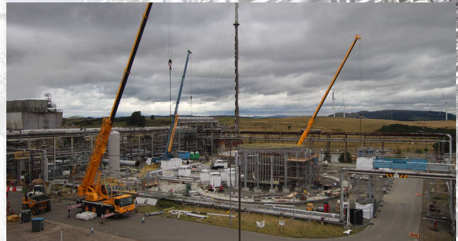
Progressing installation of manifold and initial spools