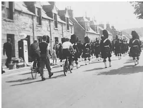
Picture taken on the day of the Tomintoul Highland Games in the 1950s. The Esso pump is in the background.