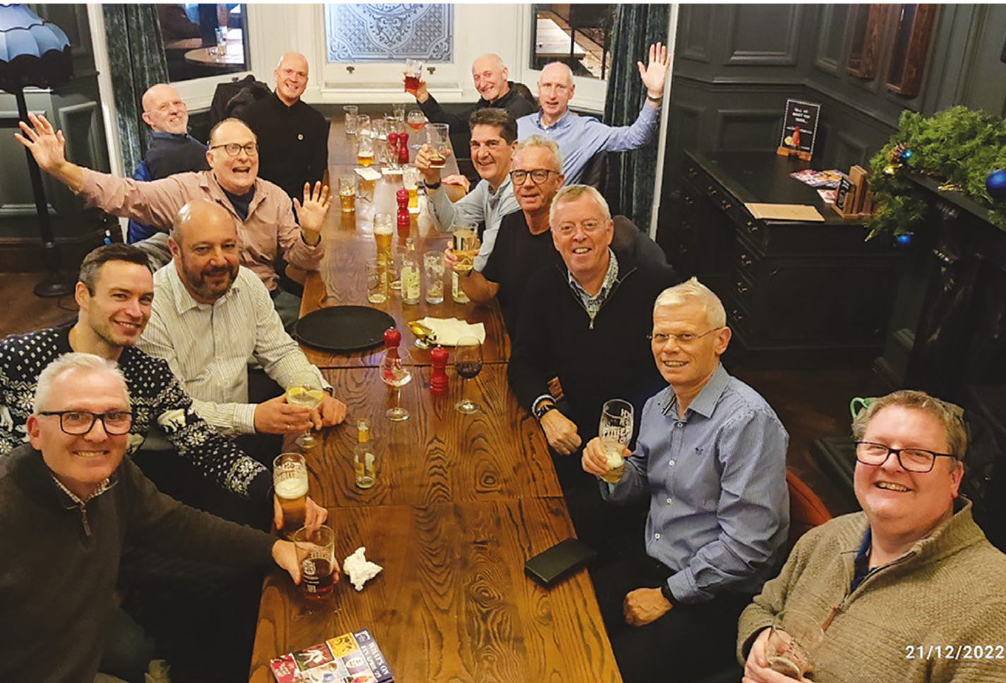
Lubricants colleagues’ reunion, 2022

This annual reunion promises to be another memorable occasion, so if you would like to book a place, please email EMLubesReunion@gmail.com