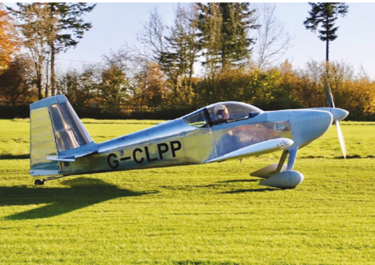
Taking to the skies